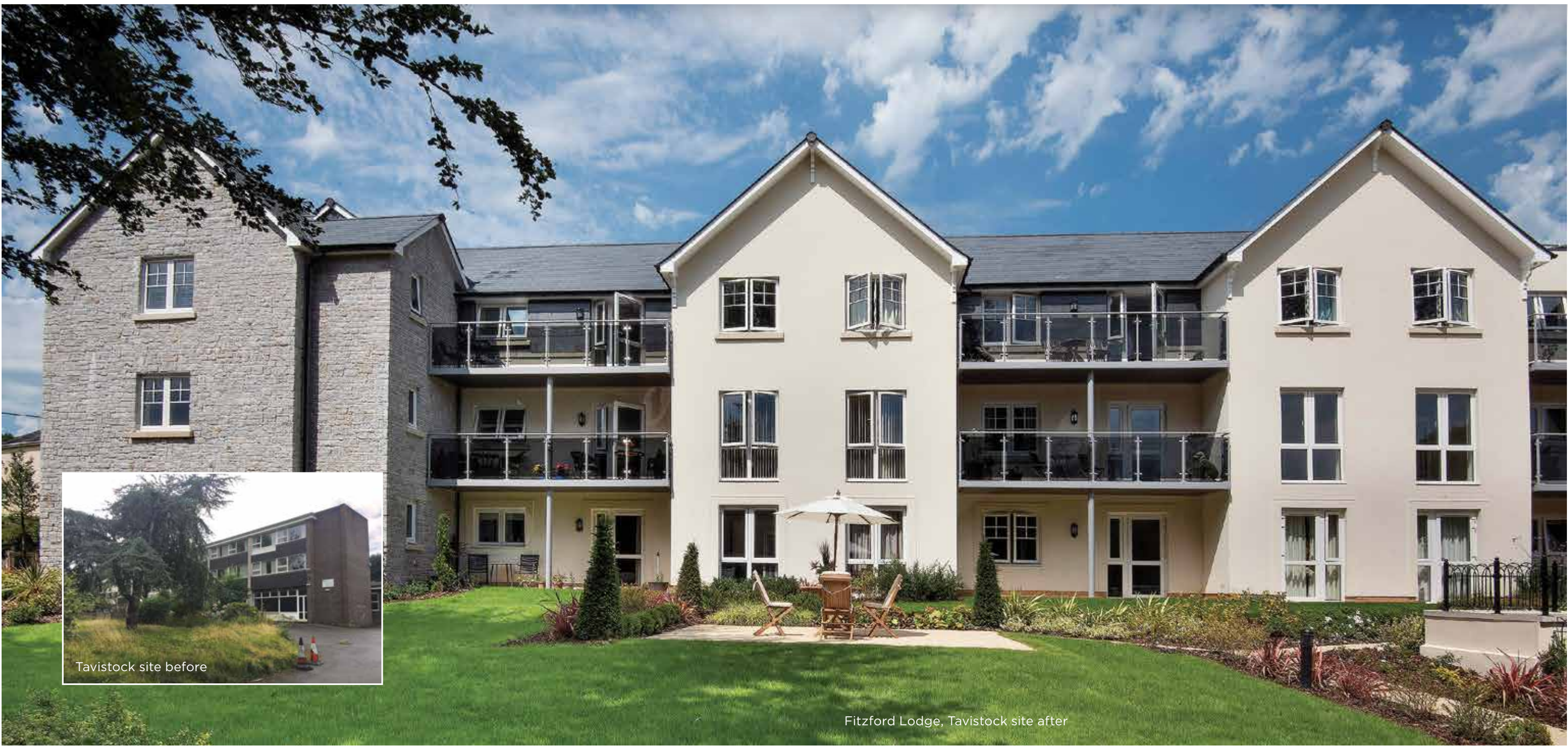
Tavistock site before