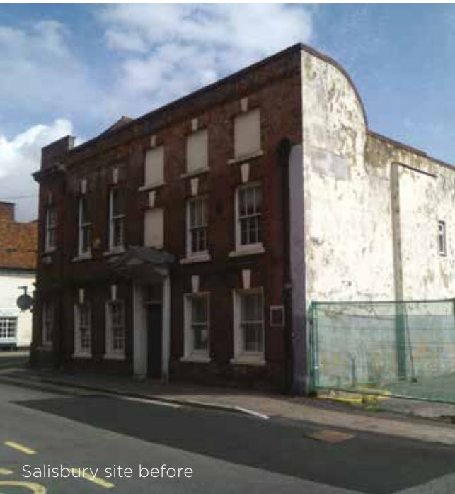
Salisbury site before

The vast majority of our schemes are situated on brownfield sites that meet the government's agenda for sustainable development, and aid local authorities in delivering necessary housing numbers on previously developed land as opposed to greenfield sites. This can improve the quality of the urban fabric of an area and regenerate poorly utilised parcels of land within town centres - helping to bring business back to the local high street.