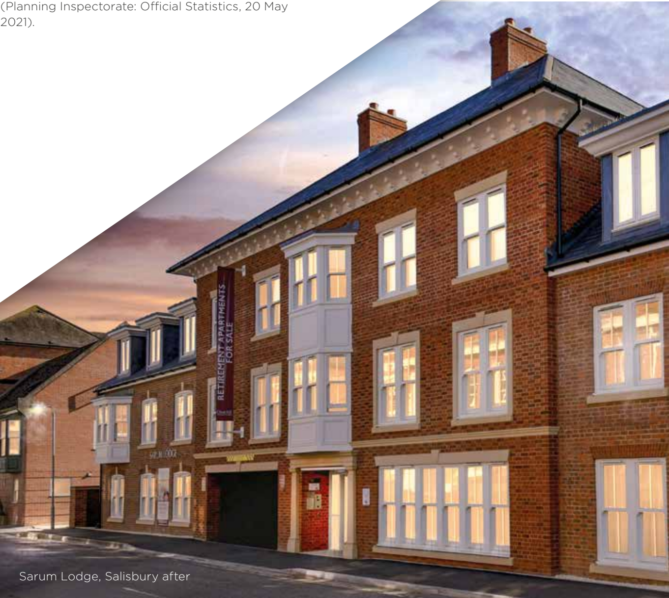
Sarum Lodge, Salisbury after

It all begins with land. We have embarked on £800m of investment over the coming years to support our growth plans. As a team we are extremely proud of what we do, and take great pride in delivering high quality sites to provide our customers with excellent places to live across a diverse range of locations.